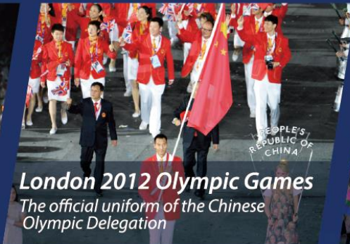
London 2012 Olympic Games The official uniform of the Chinese Olympic Delegation