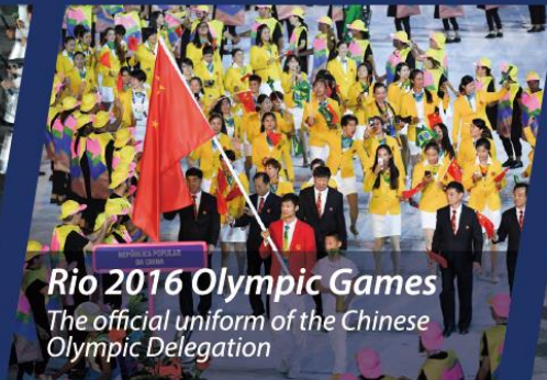
Rio 2016 Olympic Games The official uniform of the Chinese Olympic Delegation