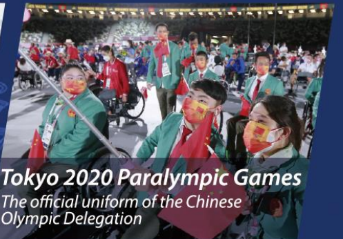
Tokyo 2020 Paralympic Games The official uniform of the Chinese Olympic Delegation