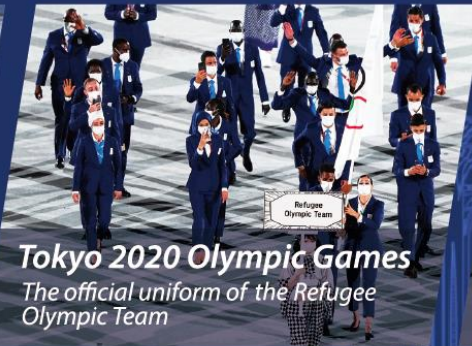
Tokyo 2020 Olympic Games The official uniform of the Refugee Olympic Team